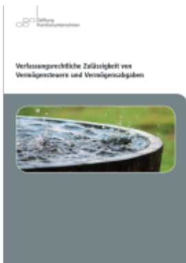
Verfassungsrechtliche Zulässigkeit von Vermögenssteuern und Vermögensabgaben Ladenpreis: 30,80EUR