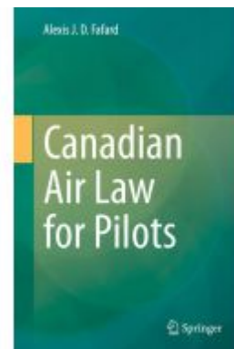
Canadian Air Law for Pilots Ladenpreis: 219,99EUR