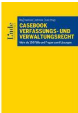
Casebook Verfassungs- und Verwaltungsrecht Ladenpreis: 29,00EUR