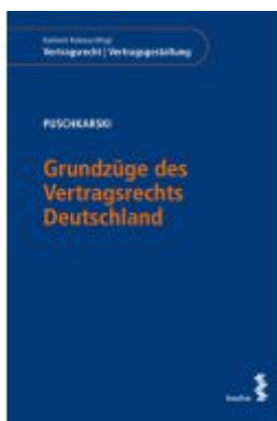
Grundzüge des Vertragsrechts Deutschland Ladenpreis: 64,00EUR