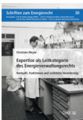
Expertise als Leitkategorie des Energieverwaltungsrechts Ladenpreis: 52,00EUR