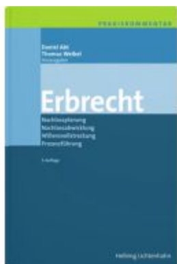
Praxiskommentar Erbrecht Ladenpreis: 361,00EUR