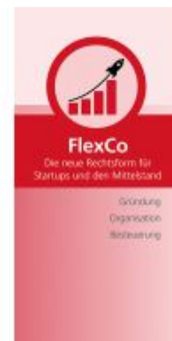
FlexCo Ladenpreis: 15,00EUR