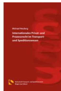
Internationales Privat- und Prozessrecht im Transport- und Speditionswesen Ladenpreis: 25,70EUR