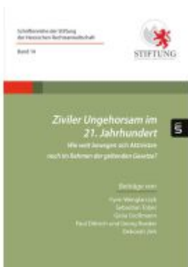
Ziviler Ungehorsam im 21. Jahrhundert Ladenpreis: 39,90EUR