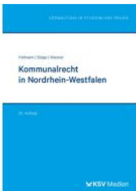
Kommunalrecht in Nordrhein-Westfalen Ladenpreis: 46,30EUR

Wir haben andere Produkte gefunden, die Ihnen gefallen könnten!