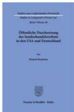
Öffentliche Durchsetzung des Insiderhandelsverbots in den USA und Deutschland Ladenpreis: 143,90EUR