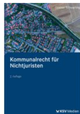
Kommunalrecht für Nichtjuristen Ladenpreis: 20,60EUR