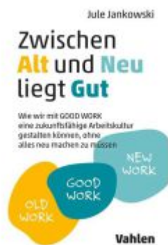
Zwischen Alt und Neu liegt Gut Ladenpreis: 27,70EUR