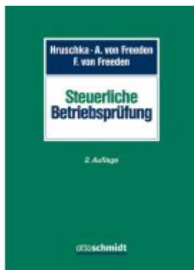
Steuerliche Betriebsprüfung Ladenpreis: 154,30EUR