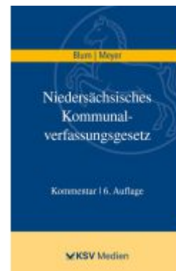
Niedersächsisches Kommunalverfassungsgesetz (NKomVG) Ladenpreis: 81,30EUR