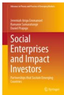
Social Enterprises and Impact Investors Ladenpreis: 131,99EUR