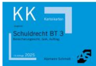
Kartekarten Schuldrecht BT 3 Ladenpreis: 14,30EUR