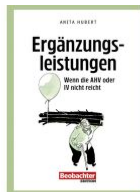
Ergänzungsleistungen Ladenpreis: 28,00EUR