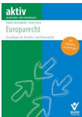
Europarecht Ladenpreis: 40,10EUR