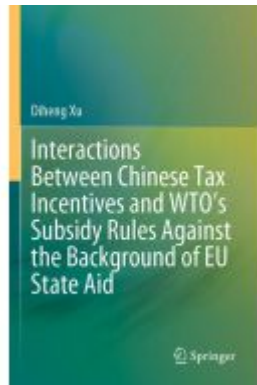
Interactions Between Chinese Tax Incentives and WTO's Subsidy Rules Against the Background of EU State Aid Ladenpreis: 164,99EUR