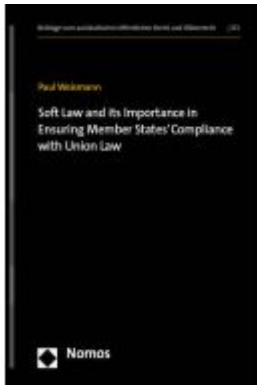
Soft Law and its Importance in Ensuring Member States' Compliance with Union Law Ladenpreis: 225,20EUR