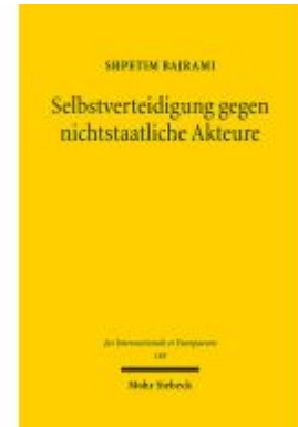
Selbstverteidigung gegen nichtstaatliche Akteure Ladenpreis: 96,70EUR