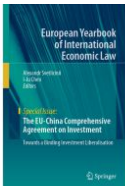
The EU-China Comprehensive Agreement on Investment Ladenpreis: 175,99EUR