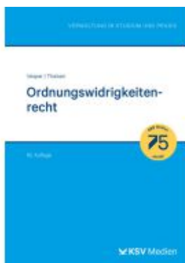
Ordnungswidrigkeitenrecht Ladenpreis: 25,70EUR