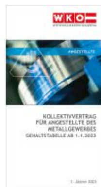
Kollektivvertrag für Angestellte des Metallgewerbes Ladenpreis: 3,60EUR