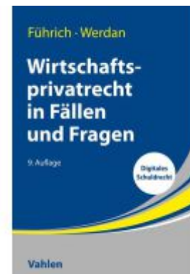
Wirtschaftsprivatrecht in Fällen und Fragen Ladenpreis: 28,70EUR