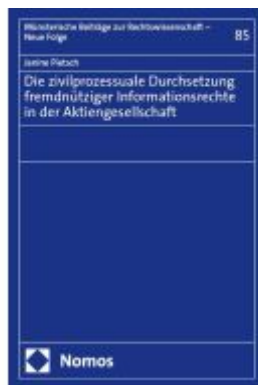
Die zivilprozessuale Durchsetzung fremdnütziger Informationsrechte in der Aktiengesellschaft Ladenpreis: 148,10EUR