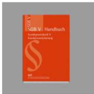
SGB V Handbuch Ladenpreis: 71,90EUR