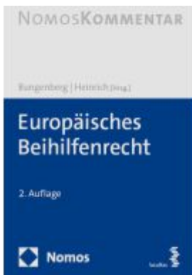
Europäisches Beihilfenrecht Ladenpreis: 307,40EUR