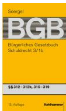
Bürgerliches Gesetzbuch mit Einführungsgesetz und Nebengesetzen (BGB) Ladenpreis: 247,00EUR