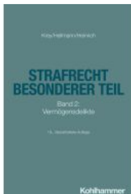
Strafrecht Besonderer Teil Ladenpreis: 30,80EUR