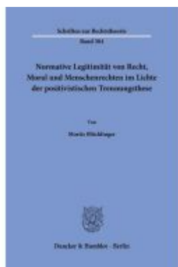
Normative Legitimität von Recht, Moral und Menschenrechten im Lichte der positivistischen Trennungsthese. Ladenpreis: 92,50EUR