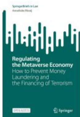
Regulating the Metaverse Economy Ladenpreis: 32,99EUR

Wir haben andere Produkte gefunden, die Ihnen gefallen könnten!