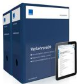
Verkehrsrecht Ladenpreis: 261,80EUR