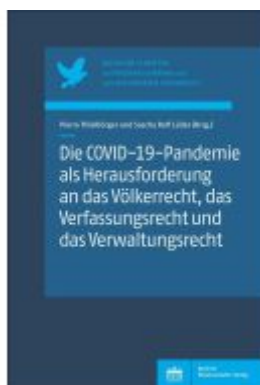
Die COVID-19-Pandemie als Herausforderung an das Völkerrecht, das Verfassungsrecht und das Verwaltungsrecht Ladenpreis: 37,10EUR