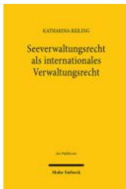
Seeverwaltungsrecht als internationales Verwaltungsrecht Ladenpreis: 142,90EUR