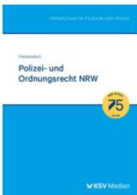
Polizei- und Ordnungsrecht NRW Ladenpreis: 41,20EUR