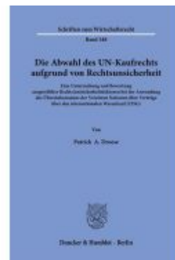
Die Abwahl des UN-Kaufrechts aufgrund von Rechtsunsicherheit. Ladenpreis: 102,70EUR