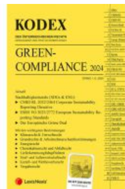
KODEX Green Compliance 2024 - inkl. App Ladenpreis: 92,00EUR