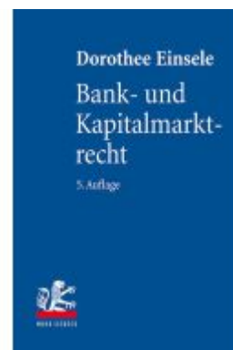
Bank- und Kapitalmarktrecht Ladenpreis: 153,20EUR