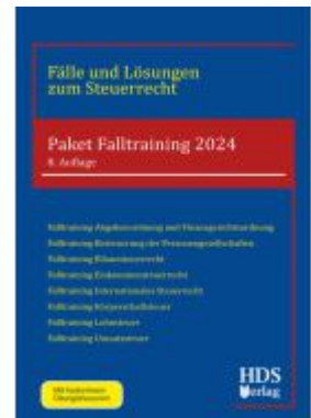
Paket Falltraining 2024 Ladenpreis: 374,60EUR