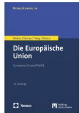
Die Europäische Union Ladenpreis: 53,00EUR