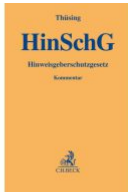
Hinweisgeberschutzgesetz Ladenpreis: 91,50EUR