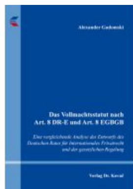
Das Vollmachtsstatut nach Art. 8 DR-E und Art. 8 EGBGB Ladenpreis: 154,00EUR