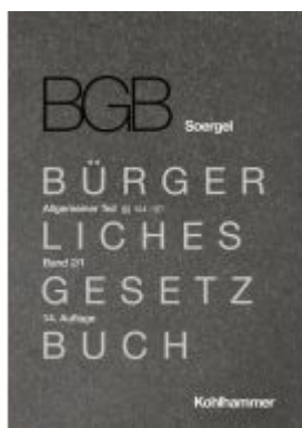
Kommentar zum Bürgerlichen Gesetzbuch mit Einführungsgesetz und Nebengesetzen (BGB) (Soergel) Ladenpreis: 545,00EUR