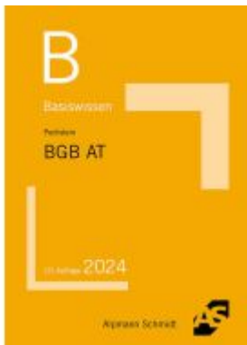
Basiswissen BGB Allgemeiner Teil Ladenpreis: 13,30EUR