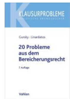
20 Probleme aus dem Bereicherungsrecht Ladenpreis: 20,40EUR