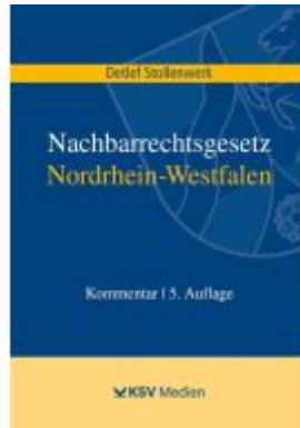
Nachbarrechtsgesetz Nordrhein-Westfalen Ladenpreis: 20,60EUR