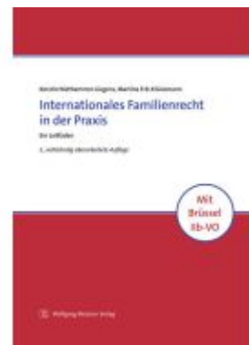
Internationales Familienrecht in der Praxis Ladenpreis: 56,40EUR