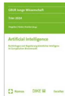
Artificial Intelligence Ladenpreis: 60,70EUR