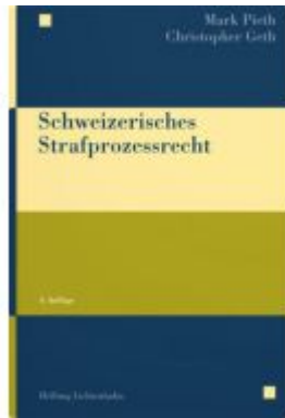
Schweizerisches Strafprozessrecht Ladenpreis: 75,00EUR