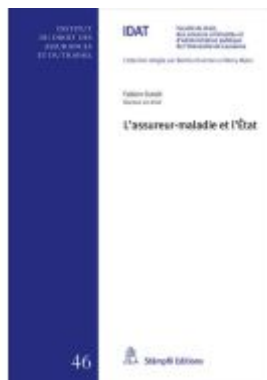
L'assureur-maladie et l'État Ladenpreis: 100,00EUR