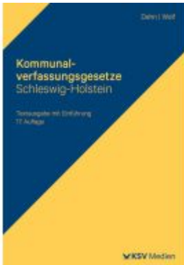
Kommunalverfassungsgesetze Schleswig-Holstein Ladenpreis: 16,50EUR