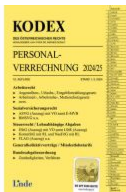
KODEX Personalverrechnung 2024/25 Ladenpreis: 45,00EUR