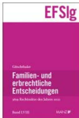
Familien- und erbrechtliche Entscheidungen EF-SIg Ladenpreis: 252,00EUR