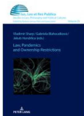
Law, Pandemics and Ownership Restrictions Ladenpreis: 51,40EUR