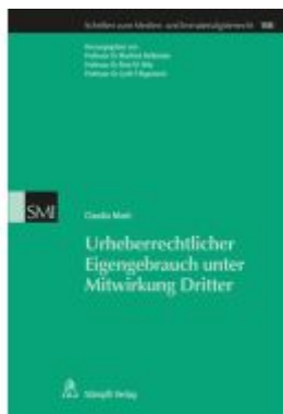
Urheberrechtlicher Eigengebrauch unter Mitwirkung Dritter Ladenpreis: 112,90EUR