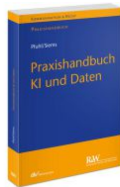
Praxishandbuch KI und Daten Ladenpreis: 91,50EUR