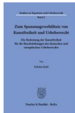
Zum Spannungsverhältnis von Kunstfreiheit und Urheberrecht. Ladenpreis: 102,70EUR