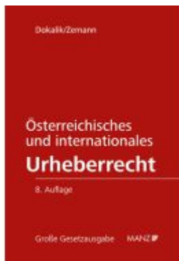
Österreichisches und internationales Urheberrecht Ladenpreis: 328,00EUR