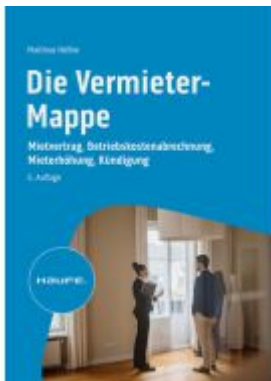
Die Vermieter-Mappe Ladenpreis: 36,00EUR

Wir haben andere Produkte gefunden, die Ihnen gefallen könnten!