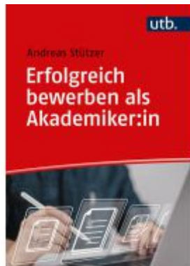
Erfolgreich bewerben als Akademiker:in Ladenpreis: 20,50EUR