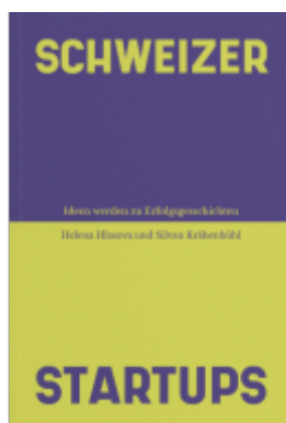
Schweizer Startups Ladenpreis: 25,60EUR