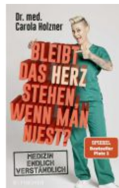
Bleibt das Herz stehen, wenn man niest? Ladenpreis: 18,50EUR