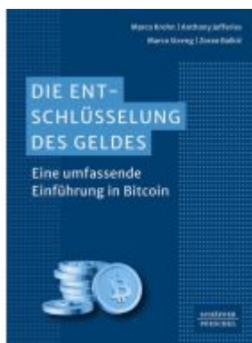
Die Entschlüsselung des Geldes Ladenpreis: 36,00EUR