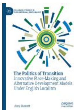
The Politics of Transition Ladenpreis: 131,99EUR