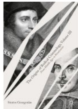
The Origins of Radical Criminology, Volume III Ladenpreis: 142,99EUR