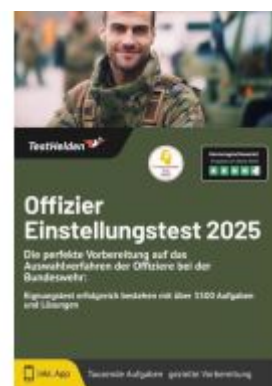
Offizier Einstellungstest 2025: Die perfekte Vorbereitung auf das Auswahlverfahren der Offiziere bei der Bundeswehr: Eignungstest erfolgreich bestehen mit über 3500 Aufgaben und Lösungen Ladenpreis: 41,10EUR