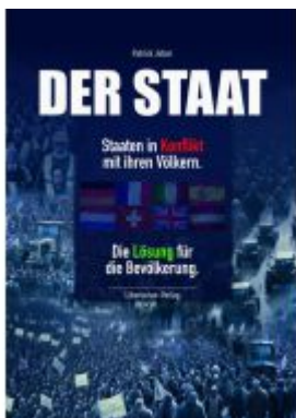
Der Staat Ladenpreis: 25,60EUR