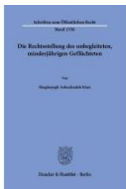
Die Rechtsstellung des unbegleiteten, minderjährigen Geflüchteten Ladenpreis: 102,70EUR