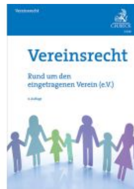
Vereinsrecht Ladenpreis: 10,20EUR