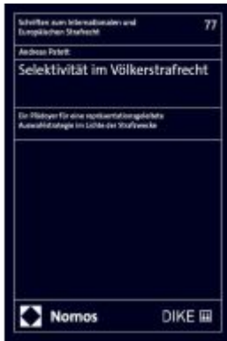
Selektivität im Völkerstrafrecht Ladenpreis: 132,70EUR