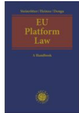
EU Platform Law Ladenpreis: 195,40EUR