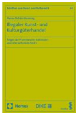
Illegaler Kunst- und Kulturgüterhandel Ladenpreis: 173,80EUR