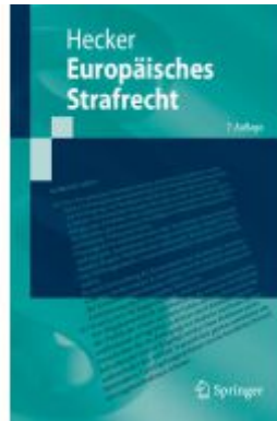
Europäisches Strafrecht Ladenpreis: 30,83EUR