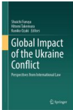
Global Impact of the Ukraine Conflict Ladenpreis: 164,99EUR