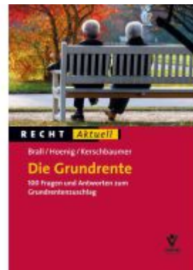
Die betriebliche Altersversorgung Ladenpreis: 29,90EUR