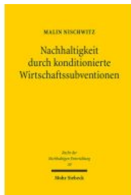
Nachhaltigkeit durch konditionierte