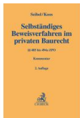
Selbständiges Beweisverfahren im privaten Baurecht