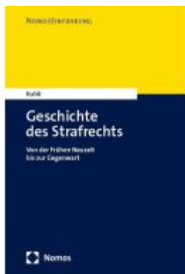
Geschichte des Strafrechts