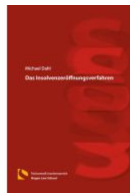
Das Insolvenzöffnungsverfahren Ladenpreis: 36,00EUR