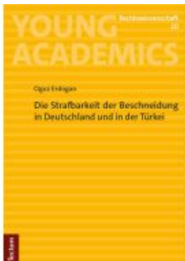
Die Strafbarkeit der Beschneidung in Deutschland und in der Türkei Ladenpreis: 30,80EUR