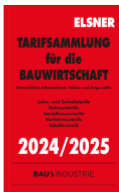
Tarifsammlung für die Bauwirtschaft 2024/2025 Ladenpreis: 61,30EUR