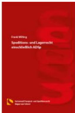
Speditions- und Lagerrecht einschließlich ADSp Ladenpreis: 36,00EUR