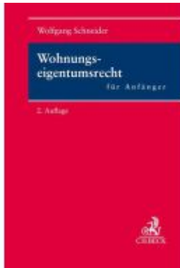
Wohnungseigentumsrecht für Anfänger Ladenpreis: 56,60EUR