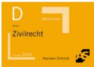
Definitionen Zivilrecht Ladenpreis: 13,30EUR