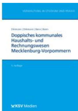
Doppisches kommunales Haushalts- und Rechnungswesen Mecklenburg Vorpommern (NKHR M-V) Ladenpreis: 41,20EUR