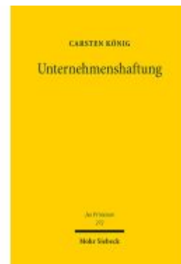
Unternehmenshaftung Ladenpreis: 153,20EUR