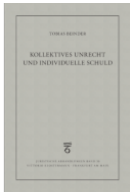
Kollektives Unrecht und individuelle Schuld Ladenpreis: 91,50EUR