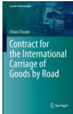
Contract for the International Carriage of Goods by Road Ladenpreis: 54,99EUR