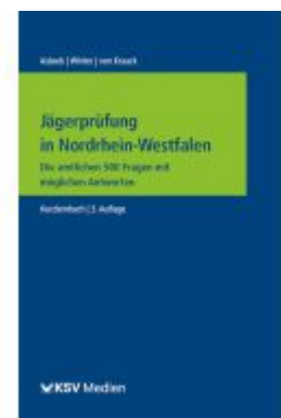
Jägerprüfung in Nordrhein-Westfalen Ladenpreis: 36,00EUR