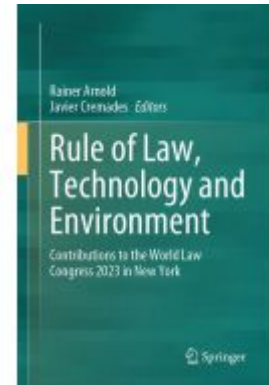
Rule of Law, Technology and Environment Ladenpreis: 219,99EUR