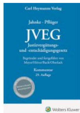
JVEG Ladenpreis: 101,80EUR