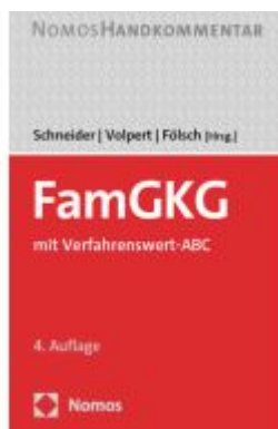
FamGKG Ladenpreis: 153,20EUR