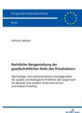
Rechtliche Neugestaltung der gesellschaftlichen Rolle des Privatsektors Ladenpreis: 63,70EUR