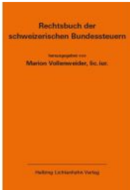
Rechtsbuch der schweizerischen Bundessteuern EL 180 Ladenpreis: 306,00EUR