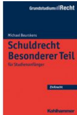
Schuldrecht Besonderer Teil Ladenpreis: 20,60EUR