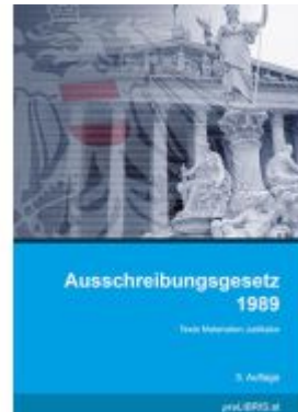
Ausschreibungsgesetz 1989 Ladenpreis: 25,00EUR