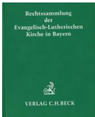
Rechtssammlung der Evangelisch-Lutherischen Kirche in Bayern Ladenpreis: 104,90EUR

Wir haben andere Produkte gefunden, die Ihnen gefallen könnten!