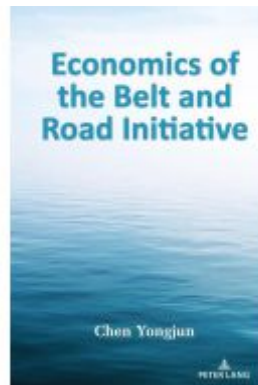
Economics of the Belt and Road Initiative Ladenpreis: 119,20EUR