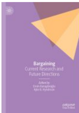
Bargaining Ladenpreis: 186,99EUR