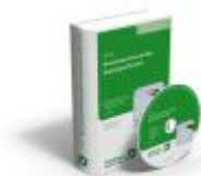
Beratungsschwerpunkte Kapitalgesellschaft Ladenpreis: 217,80EUR