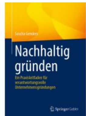
Nachhaltig gründen Ladenpreis: 51,39EUR