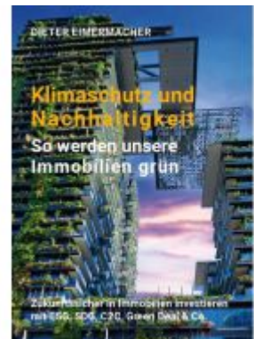
Klimaschutz und Nachhaltigkeit – so werden unsere Immobilien grün Ladenpreis: 22,60EUR