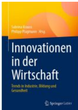
Innovationen in der Wirtschaft Ladenpreis: 61,68EUR

Wir haben andere Produkte gefunden, die Ihnen gefallen könnten!