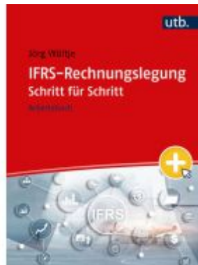
IFRS-Rechnungslegung Schritt für Schritt Ladenpreis: 30,80EUR