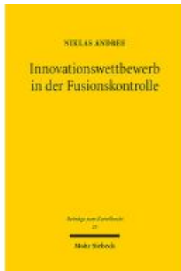
Innovationswettbewerb in der Fusionskontrolle Ladenpreis: 101,80EUR