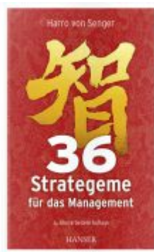
36 Strategeme für das Management Ladenpreis: 36,00EUR