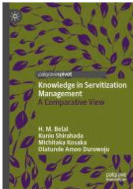
Knowledge in Servitization Management Ladenpreis: 49,49EUR