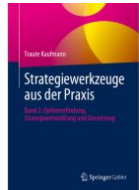
Strategiewerkzeuge aus der Praxis Ladenpreis: 46,25EUR