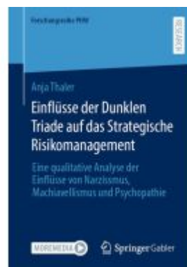
Einflüsse der Dunklen Triade auf das Strategische Risikomanagement Ladenpreis: 71,95EUR