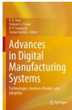
Advances in Digital Manufacturing Systems Ladenpreis: 164,99EUR