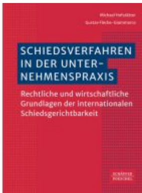
Schiedsverfahren in der Unternehmenspraxis Ladenpreis: 133,70EUR