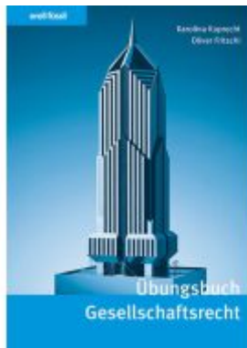
Übungsbuch Gesellschaftsrecht Ladenpreis: 39,10EUR