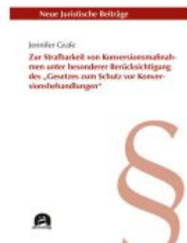
Zur Strafbarkeit von Konversionsmaßnahmen unter besonderer Berücksichtigung des „Gesetzes zum Schutz vor Konversionsbehandlungen“ Ladenpreis: 55,60EUR