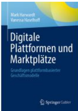
Digitale Plattformen und Marktplätze Ladenpreis: 46,26EUR