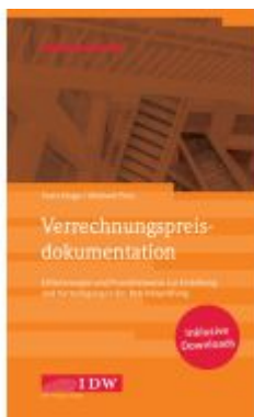
Verrechnungspreisdokumentation Ladenpreis: 50,40EUR

Wir haben andere Produkte gefunden, die Ihnen gefallen könnten!