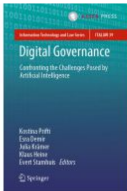
Digital Governance Ladenpreis: 197,99EUR