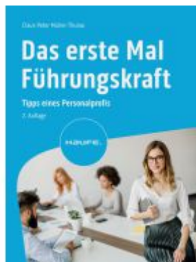
Das erste Mal Führungskraft Ladenpreis: 30,90EUR