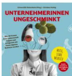
Unternehmerinnen ungeschminkt Ladenpreis: 22,70EUR