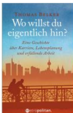
Wo willst du eigentlich hin? Ladenpreis: 25,70EUR