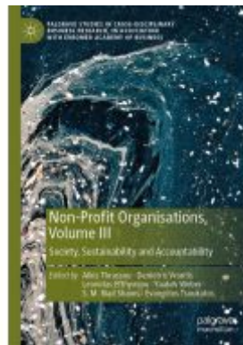
Non-Profit Organisations, Volume III Ladenpreis: 175,99EUR