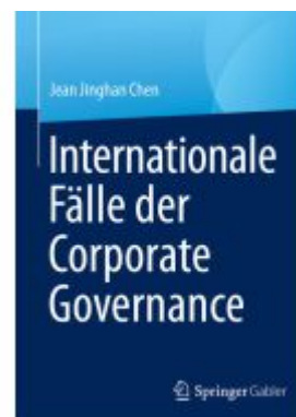
Internationale Fälle der Corporate Governance Ladenpreis: 51,39EUR