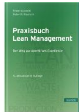
Praxisbuch Lean Management Ladenpreis: 61,70EUR