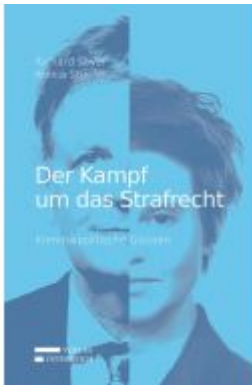
Der Kampf um das Strafrecht Ladenpreis: 25,00 EUR