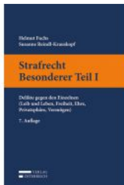
Strafrecht Besonderer Teil I Ladenpreis: 35,00 EUR