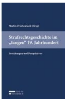
Strafrechtsgeschichte im "langen" 19. Jahrhundert Ladenpreis: 69,00 EUR