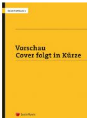
Wörterbuch Recht - Italienisch – Deutsch / Deutsch – Italienisch Ladenpreis: 49,00 EUR

Wir haben andere Produkte gefunden, die Ihnen gefallen könnten!