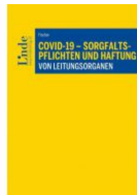
COVID-19 - Sorgfaltspflichten und Haftung von Leitungsorganen Ladenpreis: 39,00 EUR