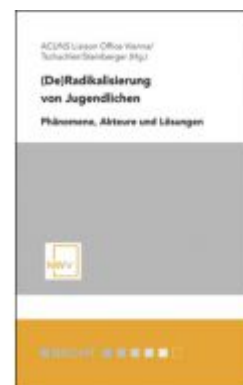
(De)Radikalisierung von Jugendlichen Ladenpreis: 34,80 EUR