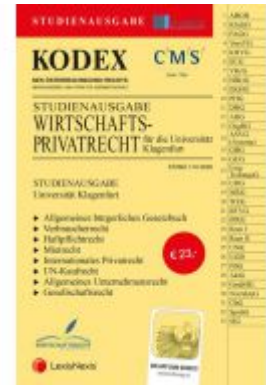
KODEX Wirtschaftsprivatrecht Klagenfurt Ladenpreis: 23,00 EUR