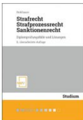
Strafrecht, Strafprozessrecht, Sanktionenrecht Ladenpreis: 32,00 EUR