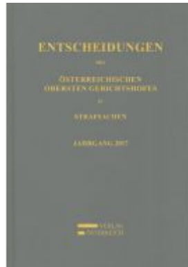
Entscheidungen des Österreichischen Obersten Gerichtshofes in Strafsachen Ladenpreis: 179,00 EUR