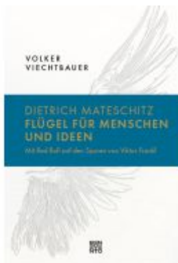
Dietrich Mateschitz: Flügel für Menschen und Ideen Ladenpreis: 26,00EUR