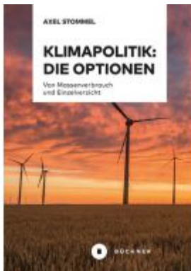
Klimapolitik: Die Optionen Ladenpreis: 22,00EUR

Wir haben andere Produkte gefunden, die Ihnen gefallen könnten!