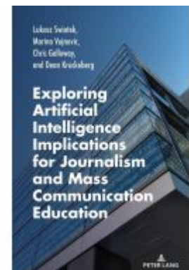
Exploring Artificial Intelligence Implications for Journalism and Mass Communication Education Ladenpreis: 37,60EUR