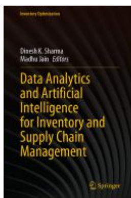
Data Analytics and Artificial Intelligence for Inventory and Supply Chain Management Ladenpreis: 164,99EUR