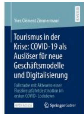
Tourismus in der Krise: COVID-19 als Auslöser für neue Geschäftsmodelle und Digitalisierung Ladenpreis: 43,99EUR