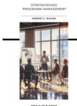
Strategisches Programm-Management Ladenpreis: 29,99EUR