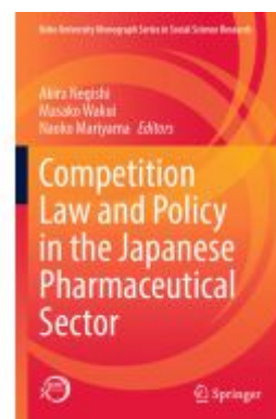
Competition Law and Policy in the Japanese Pharmaceutical Sector Ladenpreis: 153,99EUR