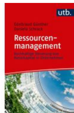
Ressourcenmanagement Ladenpreis: 25,70EUR