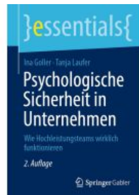
Psychologische Sicherheit in Unternehmen Ladenpreis: 15,41EUR