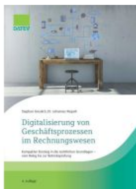
Digitalisierung von Geschäftsprozessen im Rechnungswesen Ladenpreis: 25,75EUR