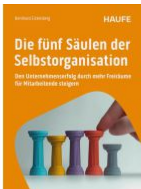
Die fünf Säulen der Selbstorganisation Ladenpreis: 41,20EUR

Wir haben andere Produkte gefunden, die Ihnen gefallen könnten!