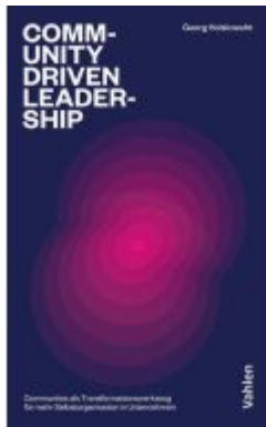
Community-driven Leadership Ladenpreis: 25,60EUR