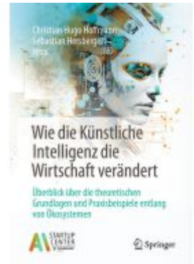
Wie die Künstliche Intelligenz die Wirtschaft verändert Ladenpreis: 56,53EUR