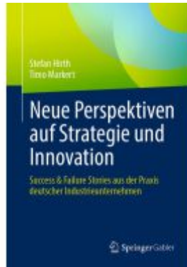
Neue Perspektiven auf Strategie und Innovation Ladenpreis: 46,25EUR