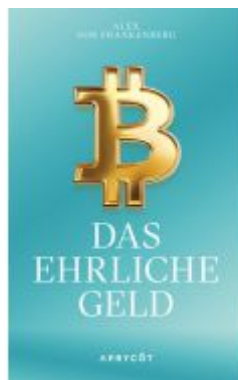
Bitcoin – Das ehrliche Geld Ladenpreis: 21,60EUR