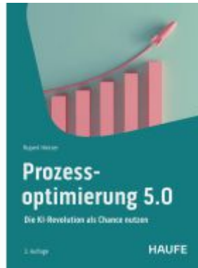
Prozessoptimierung 5.0 Ladenpreis: 46,30EUR