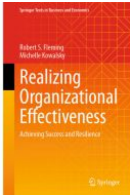
Realizing Organizational Effectiveness Ladenpreis: 109,99EUR