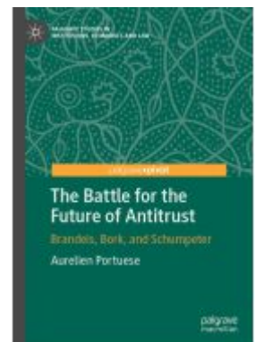
The Battle for the Future of Antitrust Ladenpreis: 43,99EUR