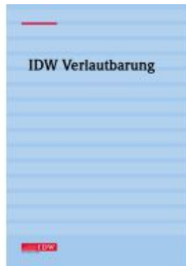
IDW Praxishinweis: Umsetzung der Anforderungen des IDW QMS 1 (09.2022) an ein risikobasiertes Qualitätsmanagementsystem in kleineren, weniger komplexen WP-Praxen (IDW Praxishinweis 3/2023) Ladenpreis: 53,50EUR