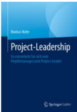
Project-Leadership Ladenpreis: 41,11EUR