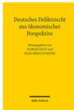
Deutsches Deliktsrecht aus ökonomischer Perspektive Ladenpreis: 91,50EUR