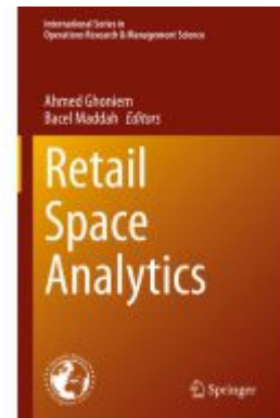
Retail Space Analytics Ladenpreis: 175,99EUR