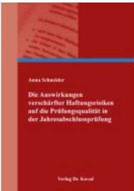
Die Auswirkungen verschärfter Haftungsrisiken auf die Prüfungsqualität in der Jahresabschlussprüfung Ladenpreis: 99,60EUR