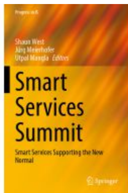
Smart Services Summit Ladenpreis: 164,99EUR