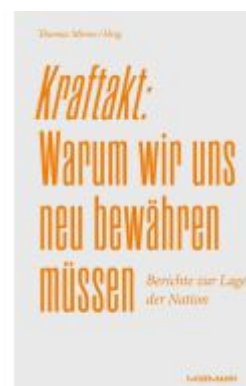
Kraftakt: Warum wir uns neu bewähren müssen Ladenpreis: 20,60EUR