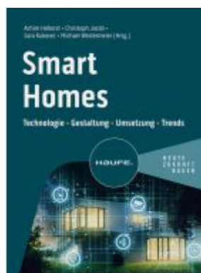
Smart Homes Ladenpreis: 51,40EUR