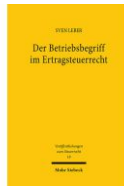
Der Betriebsbegriff im Ertragsteuerrecht Ladenpreis: 107,00EUR