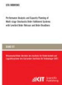
Performance Analysis and Capacity Planning of Multi-stage Stochastic Order Fulfilment Systems with Levelled Order Release and Order Deadlines Ladenpreis: 44,30EUR