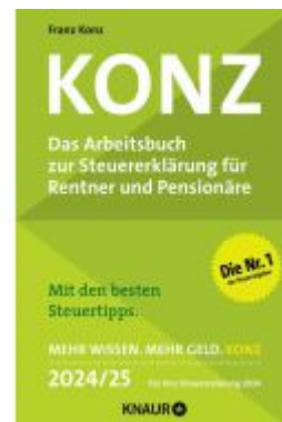
Konz Ladenpreis: 16,50EUR