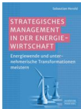
Strategisches Management in der Energiewirtschaft Ladenpreis: 51,40EUR