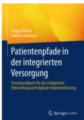
Patientenpfade in der integrierten Versorgung Ladenpreis: 51,39EUR