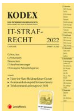
KODEX IT-Strafrecht 2022 - inkl. App Ladenpreis: 30,00EUR