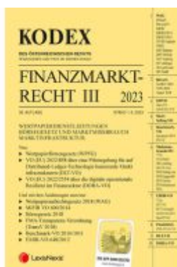
Kodex Finanzmarktrecht Band III 2023 Ladenpreis: 86,00EUR