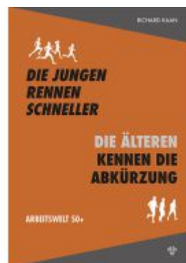
Die Jungen rennen schneller – die Älteren kennen die Abkürzung Ladenpreis: 28,00EUR