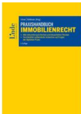
Praxishandbuch Immobilienrecht Ladenpreis: 120,00EUR