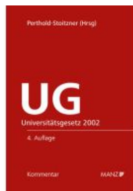
Kommentar zum Universitätsgesetz 2002 Ladenpreis: 198,00EUR