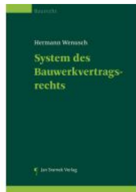
System des Bauwerkvertragsrechts Ladenpreis: 165,00EUR