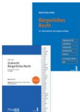
Kombipaket Bürgerliches Recht und FlexLex Zivilrecht/Bürgerliches Recht | Studium Ladenpreis: 68,00EUR