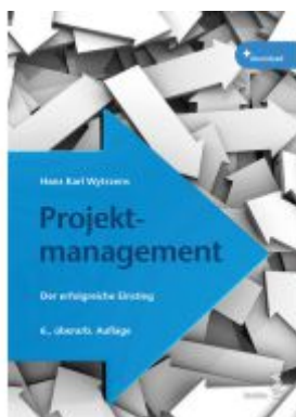
Projektmanagement Ladenpreis: 32,00EUR