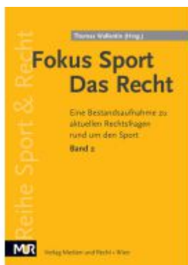
Fokus Sport - Das Recht Ladenpreis: 84,00EUR