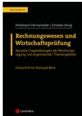
Rechnungswesen und Wirtschaftsprüfung – Festschrift für Romuald Bertl Ladenpreis: 198,00EUR