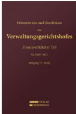
Erkenntnisse und Beschlüsse des Verwaltungsgerichtshofes Ladenpreis: 179,00EUR

Wir haben andere Produkte gefunden, die Ihnen gefallen könnten!