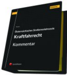
Österreichisches Straßenverkehrsrecht - Kraftfahrrecht Ladenpreis: 623,75EUR