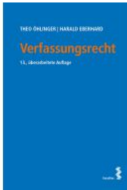
Verfassungsrecht Ladenpreis: 52,00EUR