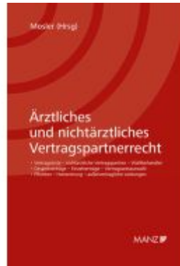
Ärztliches und nichtärztliches Vertragspartnerrecht Ladenpreis: 109,00EUR