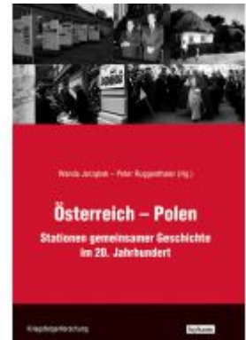
Österreich-Polen Ladenpreis: 30,00EUR