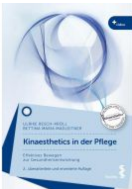
Kinaesthetics in der Pflege Ladenpreis: 32,90EUR