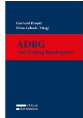
ADBG - Anti-Doping-Bundesgesetz Ladenpreis: 179,00EUR