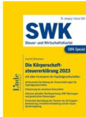
SWK-Spezial Die Körperschaftsteuererklärung 2023 Ladenpreis: 50,00EUR