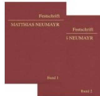
Festschrift Matthias Neumayr Ladenpreis: 498,00EUR