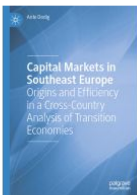
Capital Markets in Southeast Europe Ladenpreis: 109,99EUR