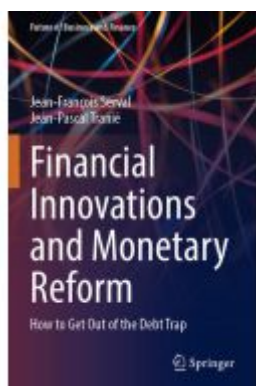
Financial Innovations and Monetary Reform Ladenpreis: 54,99EUR