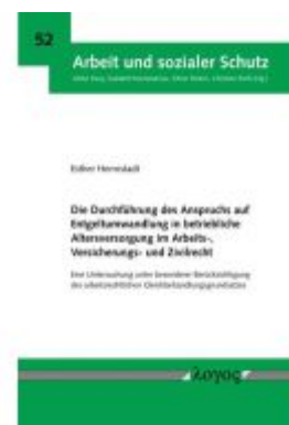
Die Durchführung des Anspruchs auf Entgeltumwandlung in betriebliche Altersversorgung im Arbeits-, Versicherungs- und Zivilrecht Ladenpreis: 53,50EUR