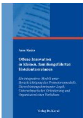
Offene Innovation in kleinen, familiengeführten Hotelunternehmen Ladenpreis: 133,50EUR