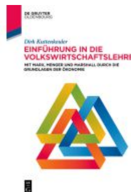
Einführung in die Volkswirtschaftslehre Ladenpreis: 44,95EUR