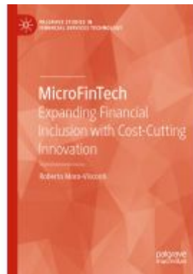
MicroFinTech Ladenpreis: 153,99EUR