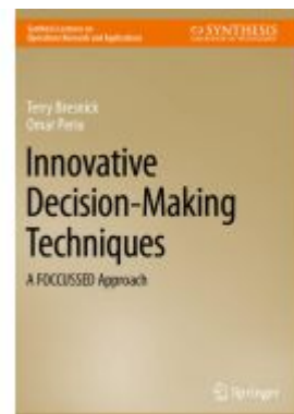
Innovative Decision-Making Techniques Ladenpreis: 54,99EUR