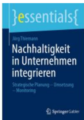
Nachhaltigkeit in Unternehmen integrieren Ladenpreis: 15,41EUR