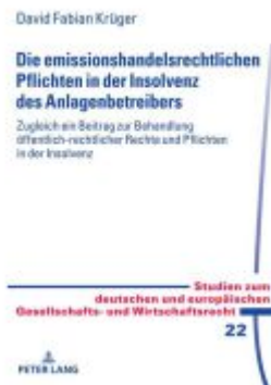
Die emissionshandelsrechtlichen Pflichten in der Insolvenz des Anlagenbetreibers Ladenpreis: 33,90EUR