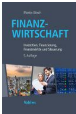
Finanzwirtschaft Ladenpreis: 41,00EUR