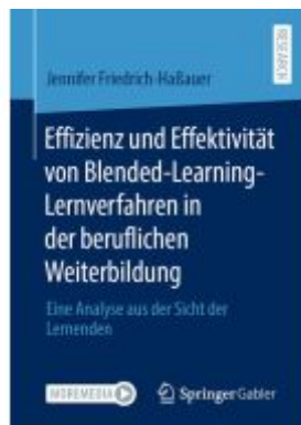
Effizienz und Effektivität von Blended-Learning-Lernverfahren in der beruflichen Weiterbildung Ladenpreis: 92,51EUR