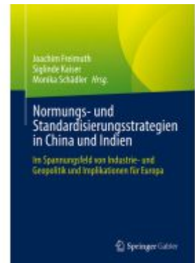
Normungs- und Standardisierungsstrategien in China und Indien Ladenpreis: 77,09EUR