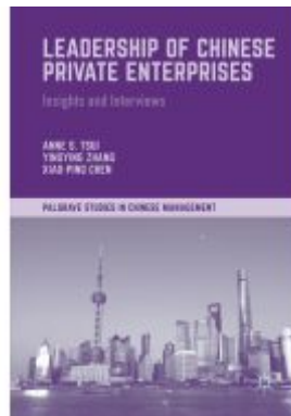
Leadership of Chinese Private Enterprises Ladenpreis: 115,49EUR