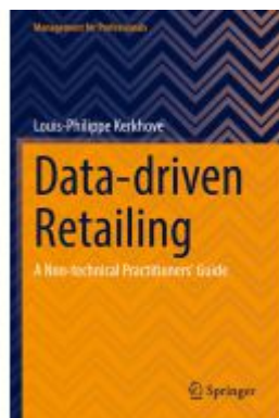
Data-driven Retailing Ladenpreis: 54,99EUR