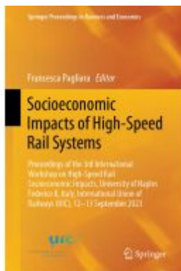
Socioeconomic Impacts of High-Speed Rail Systems Ladenpreis: 219,99EUR