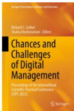
Chances and Challenges of Digital Management Ladenpreis: 164,99EUR