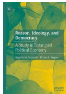
Reason, Ideology, and Democracy Ladenpreis: 142,99EUR