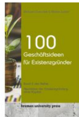
100 Geschäftsideen für Existenzgründer Ladenpreis: 20,50EUR