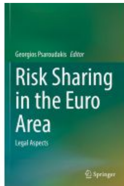
Risk Sharing in the Euro Area Ladenpreis: 175,99EUR