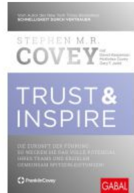
Trust & Inspire Ladenpreis: 35,90EUR