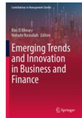
Emerging Trends and Innovation in Business and Finance Ladenpreis: 219,99EUR