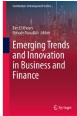
Emerging Trends and Innovation in Business and Finance Ladenpreis: 219,99EUR