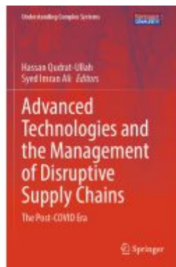
Advanced Technologies and the Management of Disruptive Supply Chains Ladenpreis: 109,99EUR