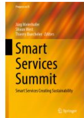
Smart Services Summit Ladenpreis: 186,99EUR