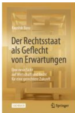
Der Rechtsstaat als Geflecht von Erwartungen Ladenpreis: 30,83EUR