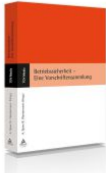
Betriebsicherheit - Eine Vorschriftensammlung Ladenpreis: 30,80EUR

Wir haben andere Produkte gefunden, die Ihnen gefallen könnten!