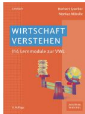
Wirtschaft verstehen Ladenpreis: 41,20EUR