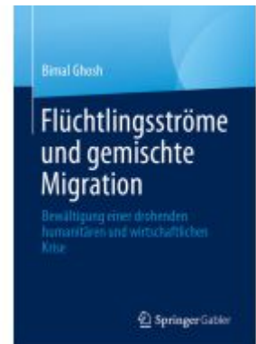
Flüchtlingsströme und gemischte Migration Ladenpreis: 92,51EUR