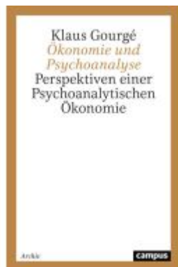
Ökonomie und Psychoanalyse Ladenpreis: 101,80EUR