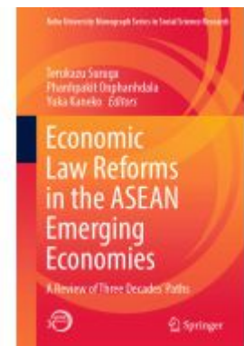
Economic Law Reforms in the ASEAN Emerging Economies Ladenpreis: 175,99EUR