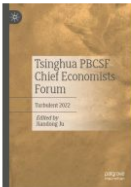
Tsinghua PBCSF Chief Economists Forum Ladenpreis: 49,49EUR