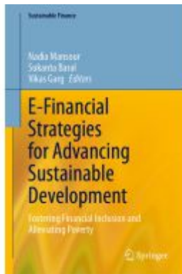
E-Financial Strategies for Advancing Sustainable Development Ladenpreis: 197,99EUR