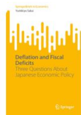
Deflation and Fiscal Deficits Ladenpreis: 43,99EUR