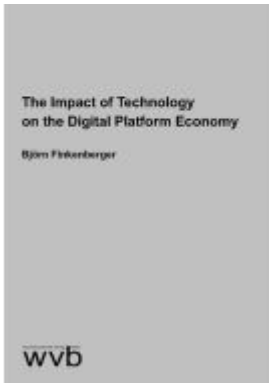
The Impact of Technology on the Digital Platform Economy Ladenpreis: 43,20EUR