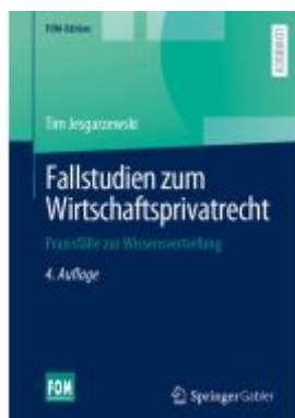
Fallstudien zum Wirtschaftsprivatrecht Ladenpreis: 25,69EUR