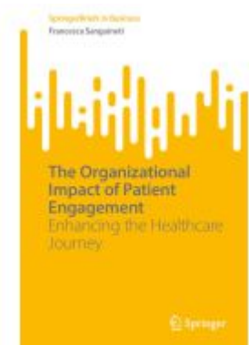
The Organizational Impact of Patient Engagement Ladenpreis: 54,99EUR

Wir haben andere Produkte gefunden, die Ihnen gefallen könnten!