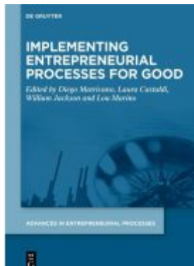
Implementing Entrepreneurial Processes for Good Ladenpreis: 109,95EUR