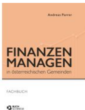
Finanzen managen in österreichischen Gemeinden Ladenpreis: 27,00EUR