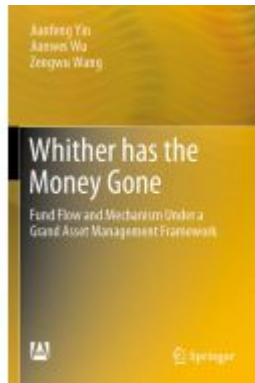
Whither has the Money Gone Ladenpreis: 131,99EUR