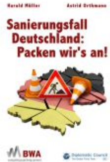
Sanierungsfall Deutschland: Packen wir's an! Ladenpreis: 25,70EUR