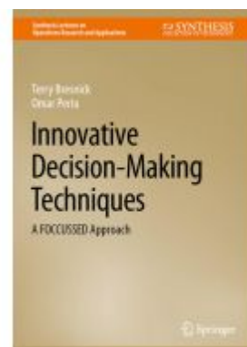
Innovative Decision-Making Techniques Ladenpreis: 54,99EUR