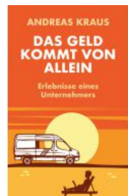
Das Geld kommt von allein Ladenpreis: 20,00EUR