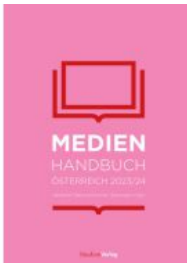
Medienhandbuch Österreich 2023/24 Ladenpreis: 34,90EUR

Wir haben andere Produkte gefunden, die Ihnen gefallen könnten!