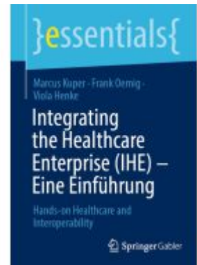
Integrating the Healthcare Enterprise (IHE) – Eine Einführung Ladenpreis: 15,41EUR