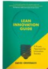
Lean Innovation Guide Ladenpreis: 29,99EUR