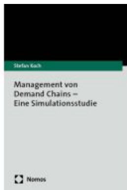
Management von Demand Chains – Eine Simulationsstudie Ladenpreis: 40,10EUR