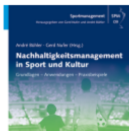
Nachhaltigkeitsmanagement in Sport und Kultur Ladenpreis: 61,70EUR