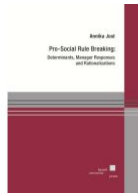
Pro-Social Rule Breaking Ladenpreis: 40,10EUR