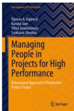
Managing People in Projects for High Performance Ladenpreis: 93,49EUR