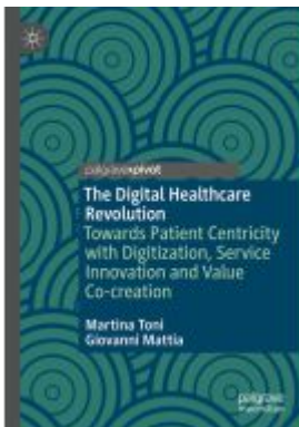
The Digital Healthcare Revolution Ladenpreis: 49,49EUR

Wir haben andere Produkte gefunden, die Ihnen gefallen könnten!