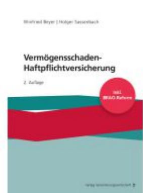
Vermögensschaden- Haftpflichtversicherung Ladenpreis: 35,80EUR