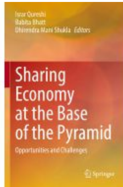
Sharing Economy at the Base of the Pyramid Ladenpreis: 186,99EUR