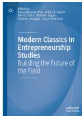
Modern Classics in Entrepreneurship Studies Ladenpreis: 120,99EUR