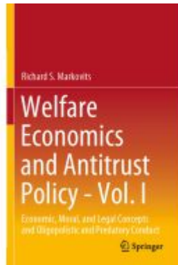
Welfare Economics and Antitrust Policy - Vol. I Ladenpreis: 87,99EUR