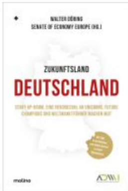
Zukunftsland Deutschland Ladenpreis: 28,80EUR