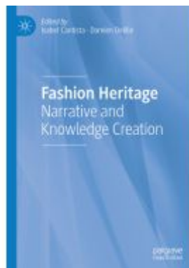
Fashion Heritage Ladenpreis: 186,99EUR