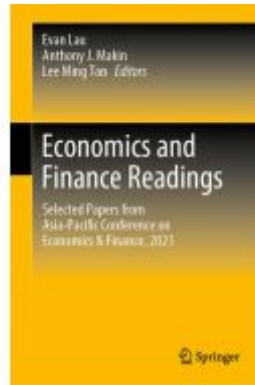
Economics and Finance Readings Ladenpreis: 197,99EUR