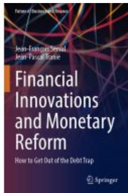
Financial Innovations and Monetary Reform Ladenpreis: 54,99EUR

Wir haben andere Produkte gefunden, die Ihnen gefallen könnten!