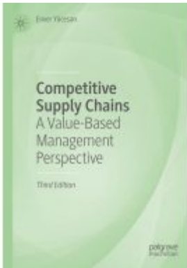
Competitive Supply Chains Ladenpreis: 131,99EUR