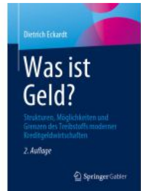
Was ist Geld? Ladenpreis: 39,06EUR