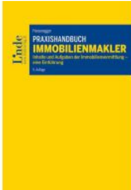
Praxishandbuch Immobilienmakler Ladenpreis: 54,00EUR