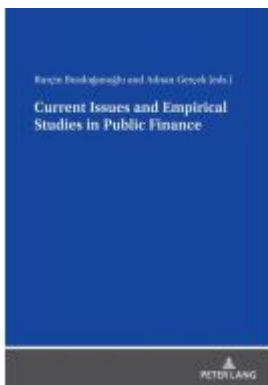
Current Issues and Empirical Studies in Public Finance Ladenpreis: 84,30EUR