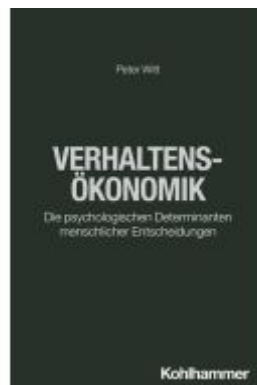
Verhaltensökonomik Ladenpreis: 40,10EUR