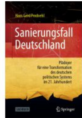
Sanierungsfall Deutschland Ladenpreis: 30,83EUR