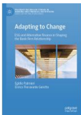
Adapting to Change Ladenpreis: 153,99EUR