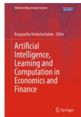
Artificial Intelligence, Learning and Computation in Economics and Finance Ladenpreis: 153,99EUR