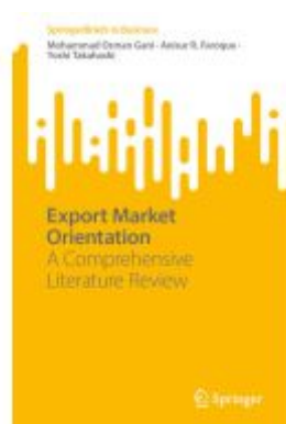
Export Market Orientation Ladenpreis: 54,99EUR