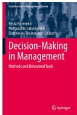
Decision-Making in Management Ladenpreis: 252,99EUR

Wir haben andere Produkte gefunden, die Ihnen gefallen könnten!