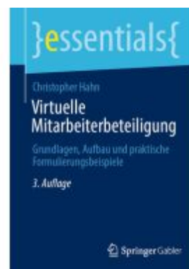
Virtuelle Mitarbeiterbeteiligung Ladenpreis: 15,41EUR