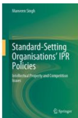
Standard-Setting Organisations' IPR Policies Ladenpreis: 153,99EUR