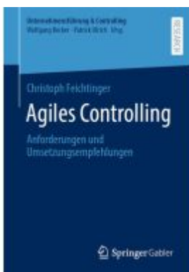
Agiles Controlling Ladenpreis: 71,95EUR