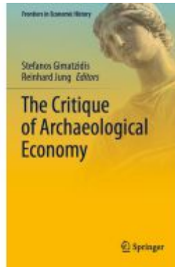
The Critique of Archaeological Economy Ladenpreis: 186,99EUR