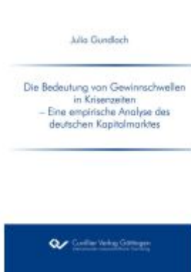
Die Bedeutung von Gewinnschwellen in Krisenzeiten Ladenpreis: 106,90EUR