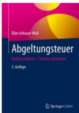
Abgeltungsteuer Ladenpreis: 56,53EUR