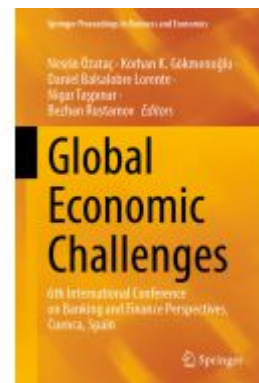
Global Economic Challenges Ladenpreis: 186,99EUR