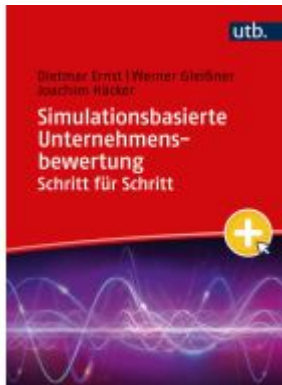
Simulationsbasierte Unternehmensbewertung Schritt für Schritt Ladenpreis: 27,70EUR