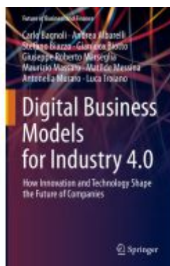
Digital Business Models for Industry 4.0 Ladenpreis: 109,99EUR