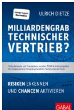
Milliardengrab Technischer Vertrieb? Ladenpreis: 32,90EUR

Wir haben andere Produkte gefunden, die Ihnen gefallen könnten!