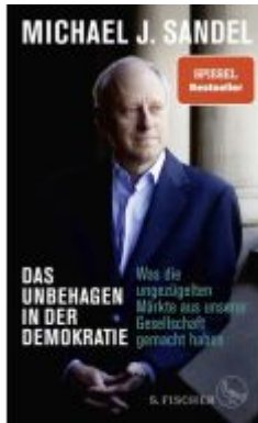
Das Unbehagen in der Demokratie Ladenpreis: 32,90EUR