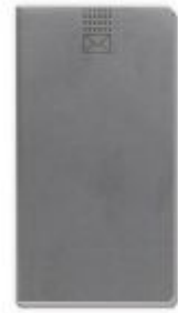
Tröttsch Adressbuch Soft Touch Slim Anthrazit