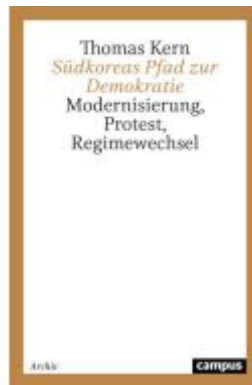
Südkoreas Pfad zur Demokratie