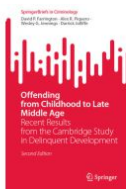
Offending from Childhood to Late Middle Age Ladenpreis: 54,99EUR