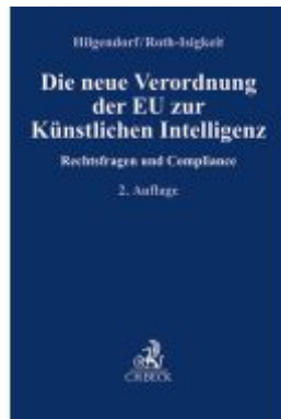
Die neue Verordnung der EU zur Künstlichen Intelligenz Ladenpreis: 113,10EUR