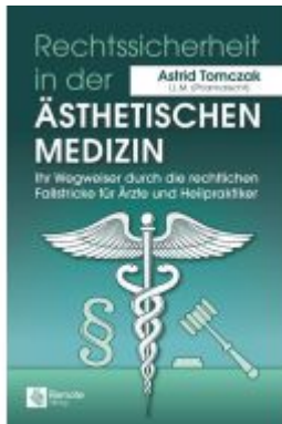
Rechtssicherheit in der ästhetischen Medizin