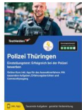
Polizei Thüringen Einstellungstest: Erfolgreich bei der Polizei bewerben: Online-Kurs inkl. App für das Auswahlverfahren. Mit tausenden Aufgaben, Erfahrungsberichten und Communityzugang Ladenpreis: 41,10EUR