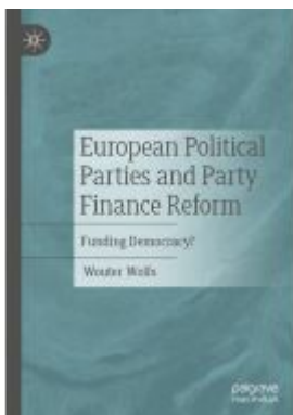
European Political Parties and Party Finance Reform Ladenpreis: 131,99EUR