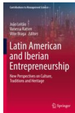
Latin American and Iberian Entrepreneurship Ladenpreis: 153,99EUR