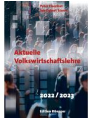
Aktuelle Volkswirtschaftslehre 2022/2023 Ladenpreis: 50,00EUR