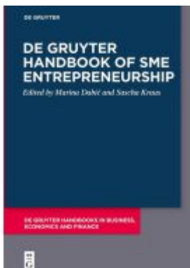
De Gruyter Handbook of SME Entrepreneurship Ladenpreis: 139,95EUR