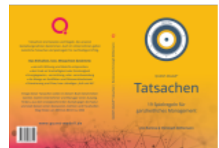
QUANT-Modell® Tatsachen Ladenpreis: 20,60EUR