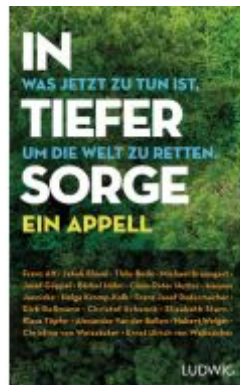
In tiefer Sorge Ladenpreis: 22,70EUR