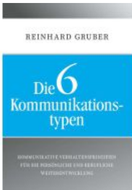
Die 6 Kommunikationstypen Ladenpreis: 22,90EUR

Wir haben andere Produkte gefunden, die Ihnen gefallen könnten!