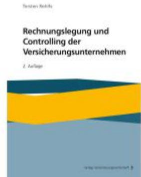
Rechnungslegung und Controlling der Versicherungsunternehmen Ladenpreis: 131,60EUR