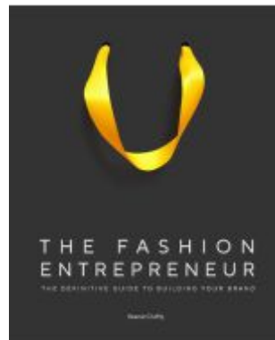
The Fashion Entrepreneur Ladenpreis: 36,00EUR