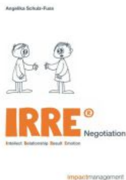
IRRE negotiation Ladenpreis: 42,90EUR