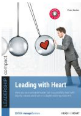
Leading with Heart Ladenpreis: 30,80EUR

Wir haben andere Produkte gefunden, die Ihnen gefallen könnten!