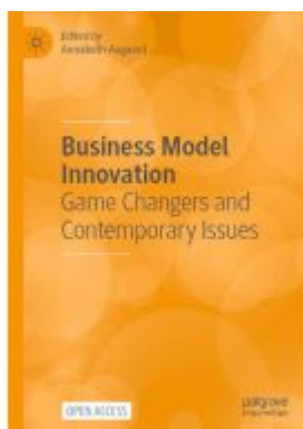
Business Model Innovation Ladenpreis: 54,99EUR