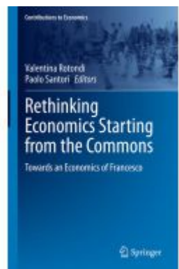
Rethinking Economics Starting from the Commons Ladenpreis: 153,99EUR