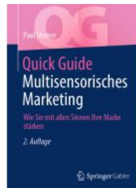
Quick Guide Multisensorisches Marketing Ladenpreis: 28,77EUR