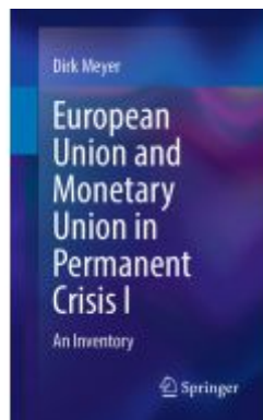
European Union and Monetary Union in Permanent Crisis I Ladenpreis: 54,99EUR