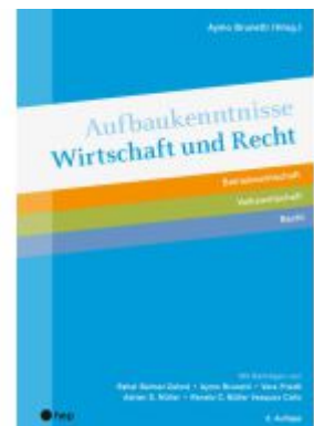
Aufbaukenntnisse Wirtschaft und Recht Ladenpreis: 34,00EUR