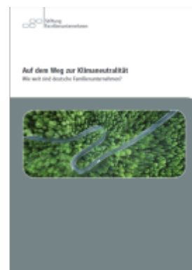
Auf dem Weg zur Klimaneutralität Ladenpreis: 41,10EUR