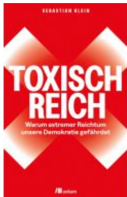
Toxisch Reich Ladenpreis: 19,60EUR

Wir haben andere Produkte gefunden, die Ihnen gefallen könnten!