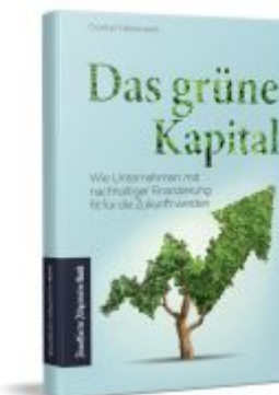
Das grüne Kapital Ladenpreis: 24,60EUR