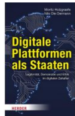
Digitale Plattformen als Staaten Ladenpreis: 36,00EUR