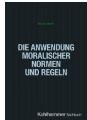
Die Anwendung moralischer Normen und Regeln Ladenpreis: 25,70EUR