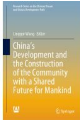
China's Development and the Construction of the Community with a Shared Future for Mankind Ladenpreis: 186,99EUR