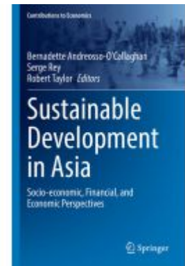
Sustainable Development in Asia Ladenpreis: 164,99EUR