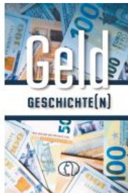
Geldgeschichte(n) Ladenpreis: 6,20EUR