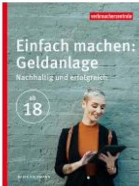
Einfach machen: Geldanlage Ladenpreis: 20,60EUR