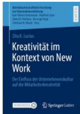
Kreativität im Kontext von New Work Ladenpreis: 71,95EUR