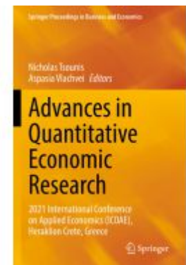
Advances in Quantitative Economic Research Ladenpreis: 219,99EUR