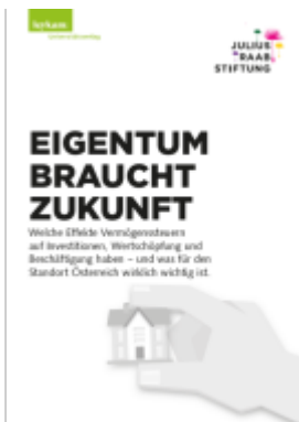
EIGENTUM BRAUCHT ZUKUNFT Ladenpreis: 35,00EUR