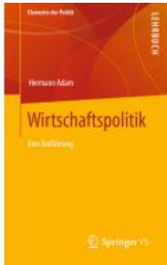
Wirtschaftspolitik Ladenpreis: 35,97EUR