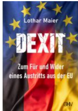
Dexit Ladenpreis: 19,50EUR