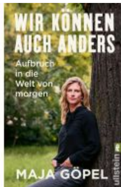
Wir können auch anders Ladenpreis: 14,40EUR