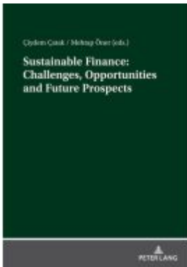
Sustainable Finance: Challenges, Opportunities and Future Prospects Ladenpreis: 56,50EUR