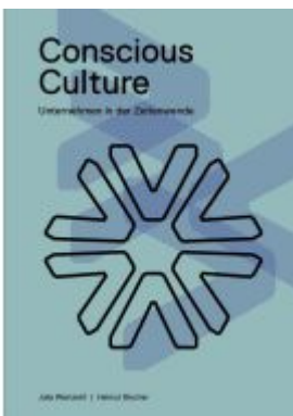
Conscious Culture Ladenpreis: 24,70EUR