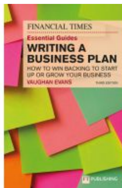
The Financial Times Essential Guide to Writing a Business Plan: How to win backing to start up or grow your business Ladenpreis: 26,74EUR