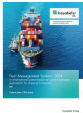
Fleet Management Systems 2024 Ladenpreis: 163,50EUR