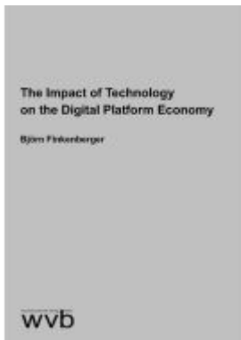
The Impact of Technology on the Digital Platform Economy Ladenpreis: 43,20EUR

Wir haben andere Produkte gefunden, die Ihnen gefallen könnten!