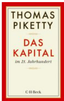
Das Kapital im 21. Jahrhundert Ladenpreis: 20,60EUR