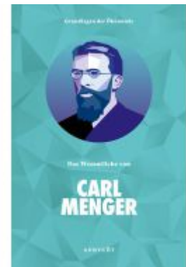
Grundlagen der Ökonomie: Das Wesentliche von Carl Menger Ladenpreis: 10,30EUR