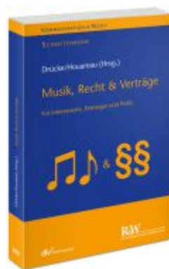
Musik, Recht & Verträge Ladenpreis: 40,10EUR