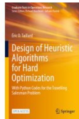
Design of Heuristic Algorithms for Hard Optimization Ladenpreis: 43,99EUR