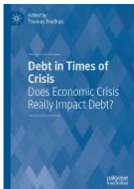
Debt in Times of Crisis Ladenpreis: 175,99EUR