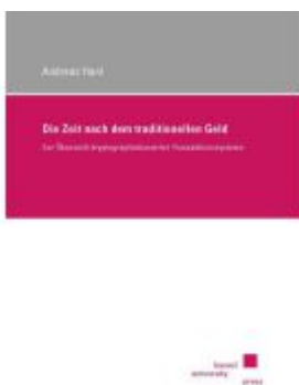
Die Zeit nach dem traditionellen Geld Ladenpreis: 40,10EUR