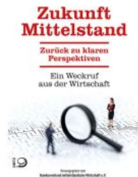
Zukunft Mittelstand Ladenpreis: 26,80EUR