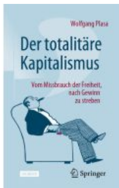
Der totalitäre Kapitalismus Ladenpreis: 20,55EUR