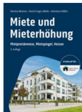
Miete und Mieterhöhung Ladenpreis: 36,00EUR