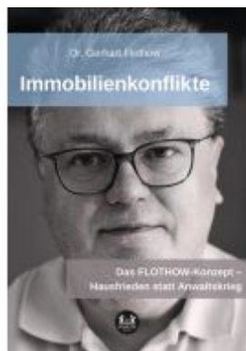
Immobilienkonflikte Ladenpreis: 42,95EUR