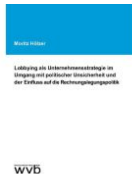
Lobbying als Unternehmensstrategie im Umgang mit politischer Unsicherheit und der Einfluss auf die Rechnungslegungspolitik Ladenpreis: 39,10EUR