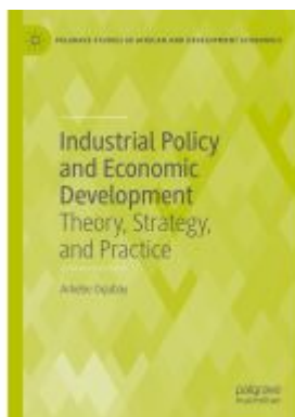
Industrial Policy and Economic Development Ladenpreis: 131,99EUR