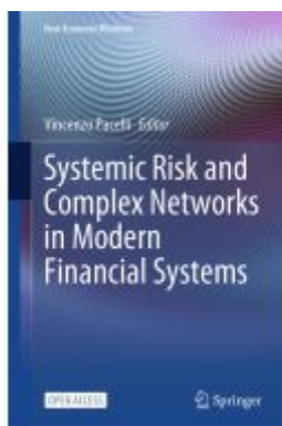
Systemic Risk and Complex Networks in Modern Financial Systems Ladenpreis: 54,99EUR