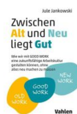
Zwischen Alt und Neu liegt Gut Ladenpreis: 27,70EUR