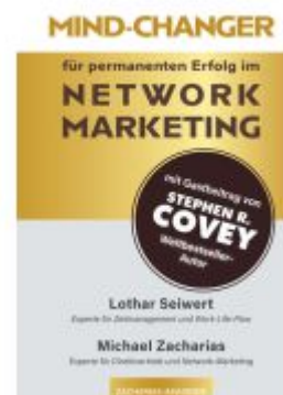
MIND-CHANGER Ladenpreis: 25,60EUR