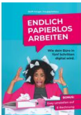
Endlich papierlos arbeiten Ladenpreis: 14,99EUR