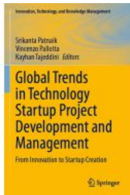
Global Trends in Technology Startup Project Development and Management Ladenpreis: 186,99EUR