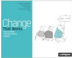
Change That Works Ladenpreis: 51,50EUR