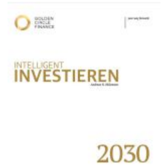
Intelligent Investieren 2030 Ladenpreis: 24,00EUR