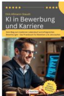
KI in Bewerbung und Karriere Ladenpreis: 17,50EUR

Wir haben andere Produkte gefunden, die Ihnen gefallen könnten!