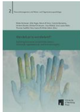
Wanderlust to wonderland? Ladenpreis: 24,70EUR