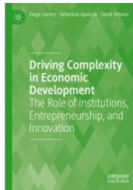
Driving Complexity in Economic Development Ladenpreis: 153,99EUR