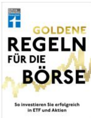
Goldene Regeln für die Börse Ladenpreis: 23,60EUR

Wir haben andere Produkte gefunden, die Ihnen gefallen könnten!