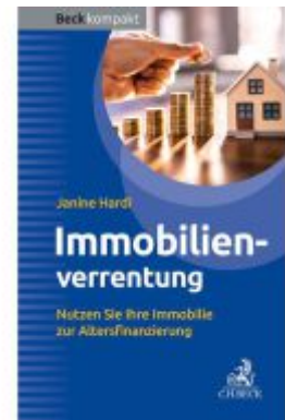
Immobilienverrentung Ladenpreis: 12,30EUR