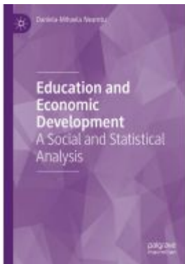
Education and Economic Development Ladenpreis: 131,99EUR