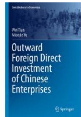
Outward Foreign Direct Investment of Chinese Enterprises Ladenpreis: 109,99EUR