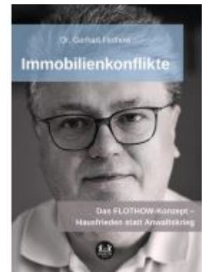
Immobilienkonflikte Ladenpreis: 20,00EUR