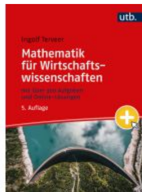
Mathematik für Wirtschaftswissenschaften Ladenpreis: 41,10EUR