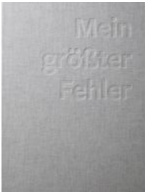
Mein größter Fehler Ladenpreis: 71,90EUR