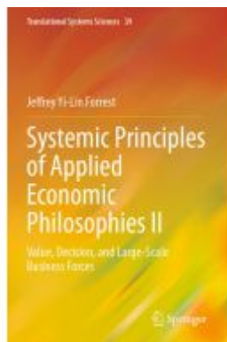
Systemic Principles of Applied Economic Philosophies II Ladenpreis: 164,99EUR