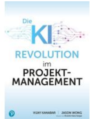
KI-Revolution im Projektmanagement Ladenpreis: 59,95EUR