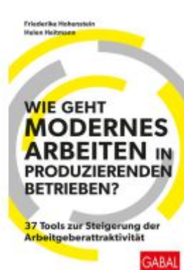
Wie geht modernes Arbeiten in produzierenden Betrieben? Ladenpreis: 30,80EUR