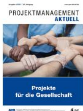
PROJEKTMANAGEMENT AKTUELL 4 (2023) Ladenpreis: 20,60EUR