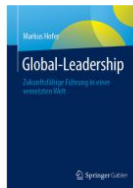
Global-Leadership Ladenpreis: 35,97EUR