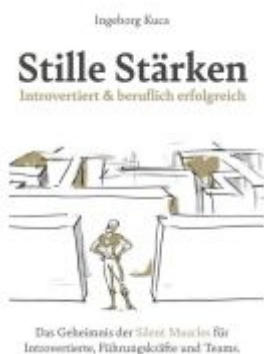
Stille Stärken: Introvertiert & beruflich erfolgreich Ladenpreis: 15,90EUR