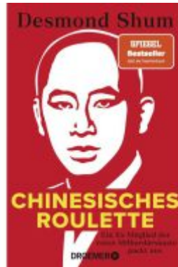
Chinesisches Roulette Ladenpreis: 13,40EUR