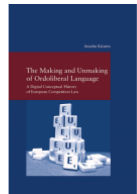
The Making and Unmaking of Ordoliberal Language Ladenpreis: 122,40EUR