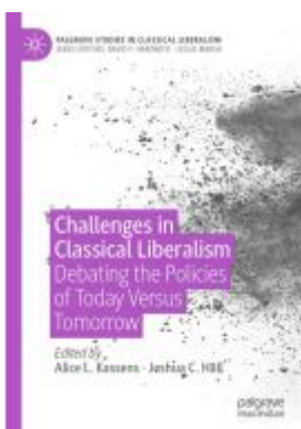
Challenges in Classical Liberalism Ladenpreis: 175,99EUR