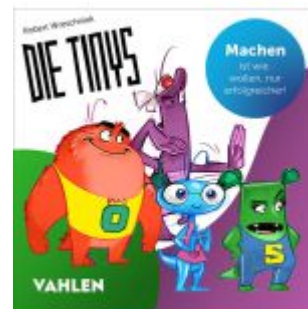
Die TINYS Ladenpreis: 17,40EUR