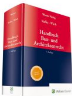
Handbuch Bau- und Architektenrecht Ladenpreis: 194,30EUR