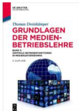
Grundlagen der Medienbetriebslehre Ladenpreis: 29,95EUR