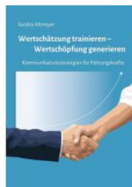
Wertschätzung trainieren – Wertschöpfung generieren Ladenpreis: 34,99EUR