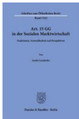
Art. 15 GG in der Sozialen Marktwirtschaft Ladenpreis: 82,20EUR