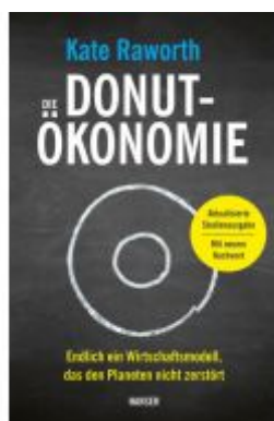
Die Donut-Ökonomie (Studienausgabe) Ladenpreis: 20,60EUR