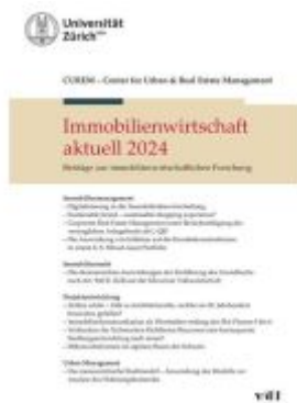
Immobilienwirtschaft aktuell 2024 Ladenpreis: 39,10EUR