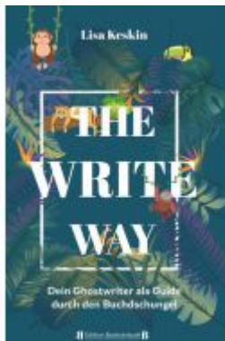
The Write Way - dein Ghostwriter als Guide durch den Buch-Dschungel Ladenpreis: 17,90EUR

Wir haben andere Produkte gefunden, die Ihnen gefallen könnten!