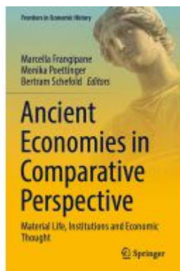
Ancient Economies in Comparative Perspective Ladenpreis: 109,99EUR