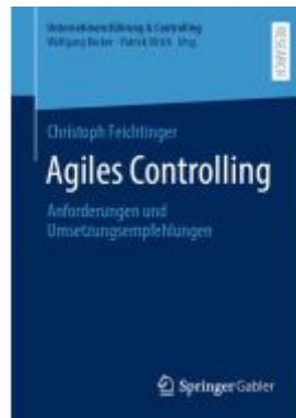
Agiles Controlling Ladenpreis: 71,95EUR