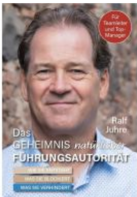
Das Geheimnis natürlicher Führungsautorität Ladenpreis: 20,60EUR