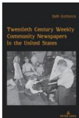
Twentieth Century Weekly Community Newspapers in the United States Ladenpreis: 44,00EUR