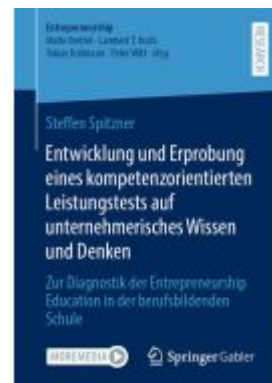
Entwicklung und Erprobung eines kompetenzorientierten Leistungstests auf unternehmerisches Wissen und Denken Ladenpreis: 77,09EUR