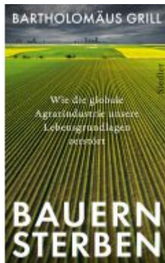
Bauernsterben Ladenpreis: 24,70EUR

Wir haben andere Produkte gefunden, die Ihnen gefallen könnten!