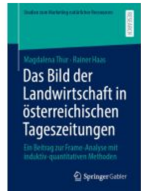
Das Bild der Landwirtschaft in österreichischen Tageszeitungen Ladenpreis: 87,37EUR