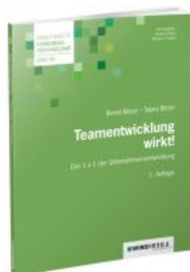
Teamentwicklung wirkt! Ladenpreis: 20,10EUR