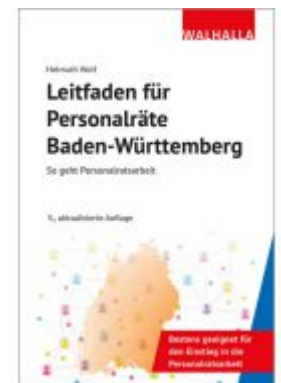
Leitfaden für Personalräte Baden- Württemberg Ladenpreis: 36,00EUR