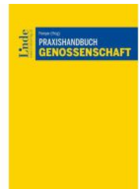
Praxishandbuch Genossenschaft Ladenpreis: 78,00EUR

Alle Preise inkl. MwSt. zzgl. Versand. Bei Bestellung im LexisNexis Onlineshop kostenloser Versand innerhalb Österreichs.