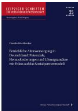
Betriebliche Altersversorgung in Deutschland Ladenpreis: 61,50EUR

Wir haben andere Produkte gefunden, die Ihnen gefallen könnten!