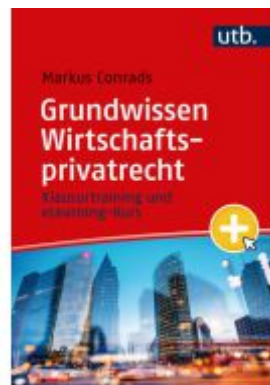
Grundwissen Wirtschaftsprivatrecht Ladenpreis: 30,80EUR