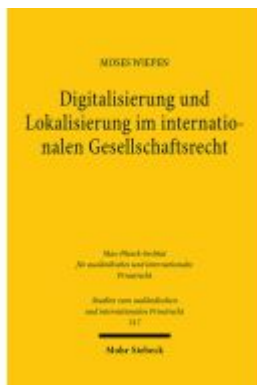
Digitalisierung und Lokalisierung im internationalen Gesellschaftsrecht Ladenpreis: 76,10EUR