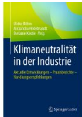
Klimaneutralität in der Industrie Ladenpreis: 56,53EUR