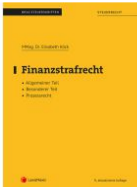
Finanzstrafrecht (Skriptum) Ladenpreis: 28,75EUR