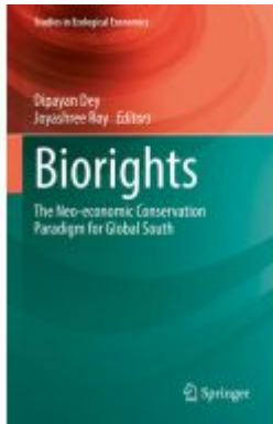
Biorights Ladenpreis: 164,99EUR