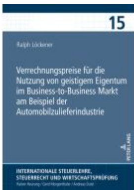
Verrechnungspreise für die Nutzung von geistigem Eigentum im Business-to-Business Markt am Beispiel der Automobilzulieferindustrie Ladenpreis: 71,90EUR

Wir haben andere Produkte gefunden, die Ihnen gefallen könnten!