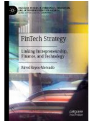
FinTech Strategy Ladenpreis: 175,99EUR