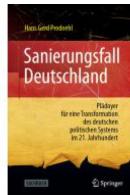
Sanierungsfall Deutschland Ladenpreis: 30,83EUR