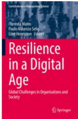
Resilience in a Digital Age Ladenpreis: 175,99EUR