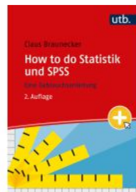
How to do Statistik und SPSS Ladenpreis: 19,50EUR