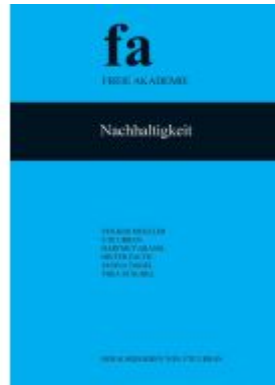
Nachhaltigkeit Ladenpreis: 20,50EUR