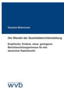
Der Wandel der Quartalsberichterstattung Ladenpreis: 45,30EUR